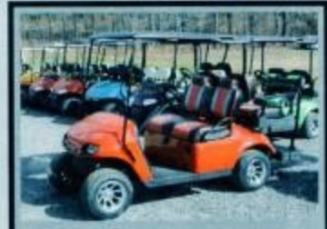
2012 EZGO TXT $5895