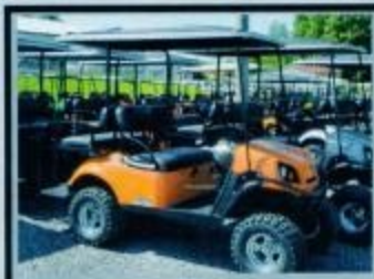
2017 EZGO S4 Starting at $8495