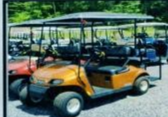
2016 EZGO TXT $6995