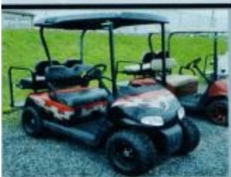
2009 EZGO RXV $5995