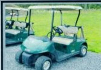
2009 EZGO RXV $2795