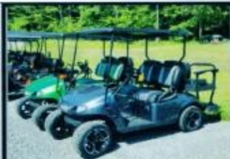
2012 EZGO TXT $5895