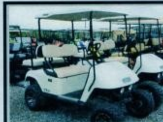
2011 EZGO TXT $4895