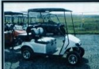
2012 EZGO TXT $5895