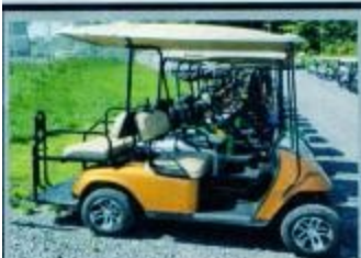
2011 EZGO TXT $4895