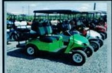
2012 EZGO TXT $5895