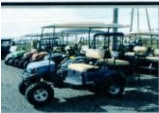
2017 EZGO S4 $8495

Serving Western Pennsylvania for over 23 years