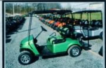
2012 EZGO TXT $4995